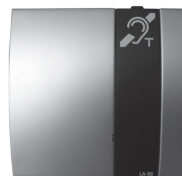
LA-90 with black inlay strip